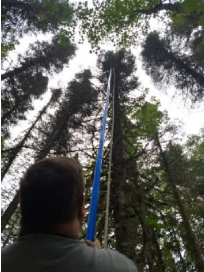
Photo: Collecting foliage from balsam fir trees in Quebec.