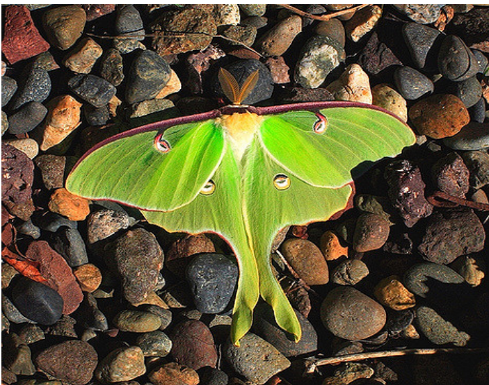
Luna Moth ( Actias luna )

Whether you are adamant gardener or a garden admirer, insects and especially pollinators are a common sight and sound. Insects provide a critical role within our gardens, such as consuming pests, pollinating flowers, and providing food for birds and small mammals. They are an essential component of an ecosystem, and many insects such as the Luna Moth or Hummingbird Clearwing (hawk moth) are also quite dazzling.