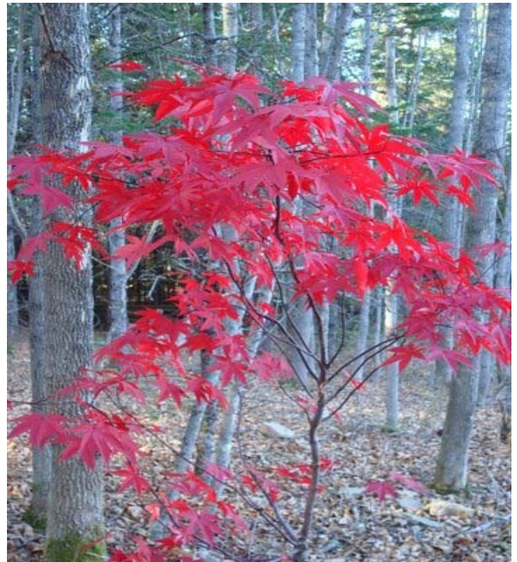
Japanese maple Memorial Garden

The ornamental grasses in the perennial planting below the Entrance Garden are looking great at this time of year. The Japanese maples, to be found in several places, are showing strong colours. Fall colours are also developing in the native trees to add to the ever changing scenery in the Fredericton Botanic Garden.