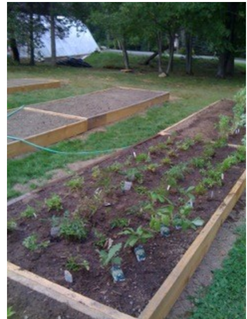
Raised beds, September 2010

Perennials are now being propagated at the Botanic Garden for the 2011 Plant Sale. This is something that has been talked about and tried before (everything old is new again!). It is a normal part of Plant Sale planning for many botanic gardens. The genesis of the idea is the need for plant material for the annual Plant Sale. As you know this is one of the main fund-raising events of the year. Over the past several years the amount of material donated by members has declined. This year's plant inventory was boosted significantly by a donation of some 900 plants by the family of the late Stephen Storey. The Plant Sale Committee again purchased herbaceous perennials and trees for the sale. When the sale was over we had about 400 plants, mostly perennials, left.